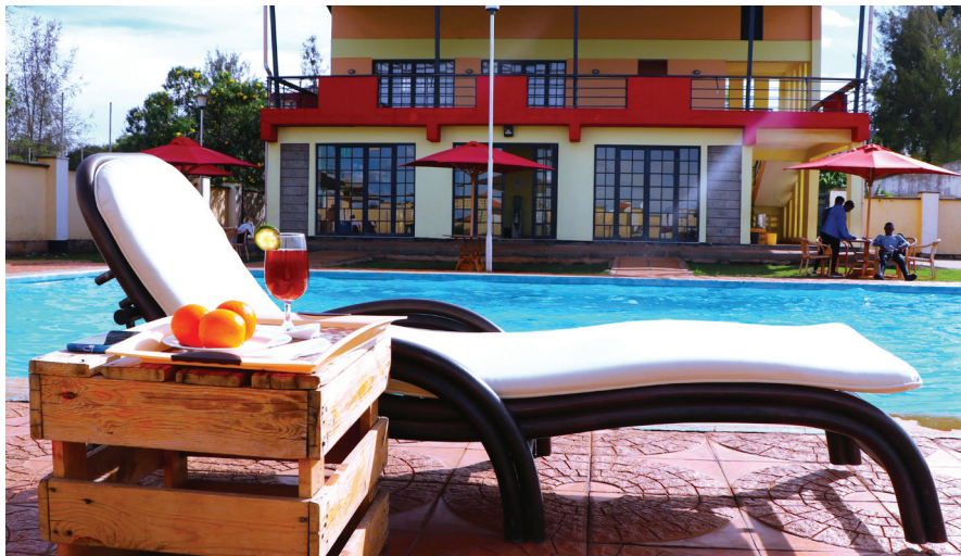
The school poolside Restaurant.