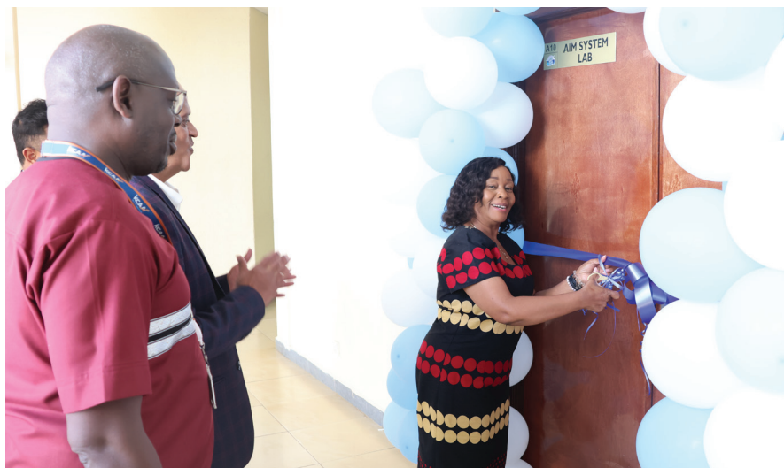
The Director, EASA officially launching the AIM Systems Lab