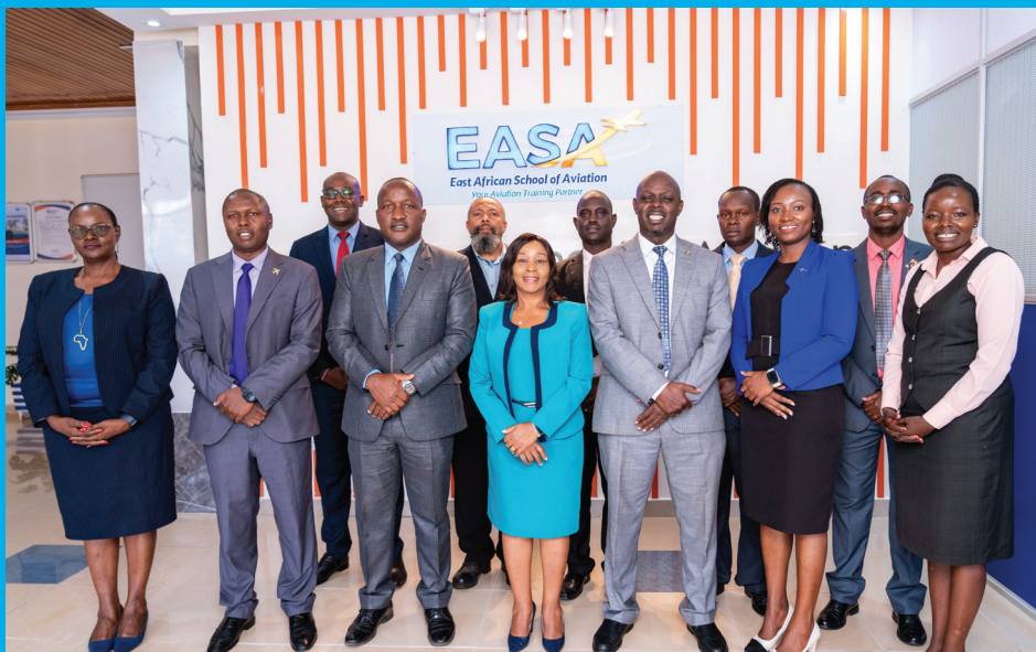
Members of the School Management Committee