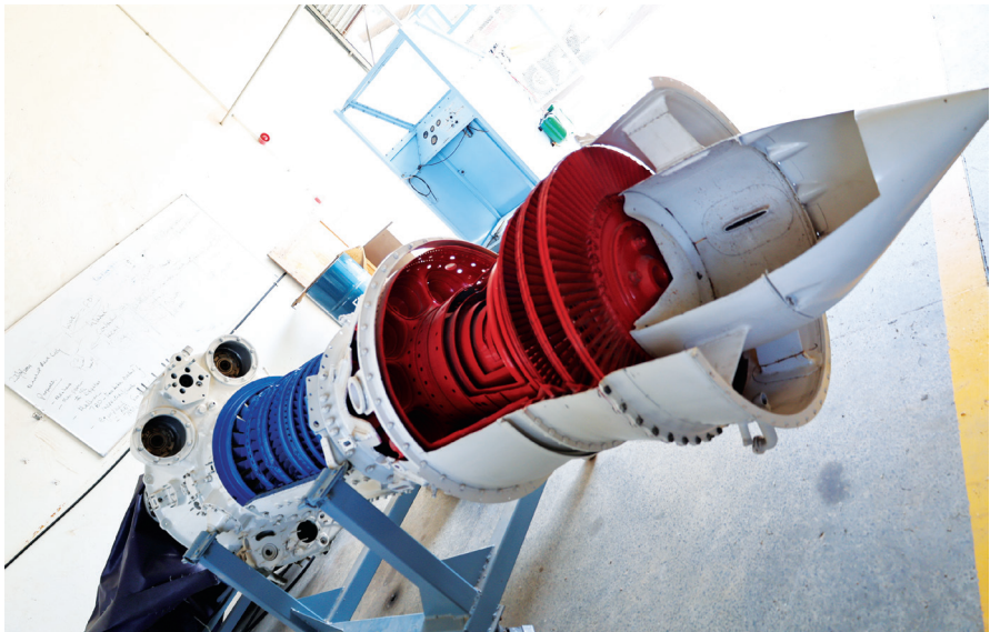
A cut-away turboprop engine used for the study of different sections of a turbo prop engine