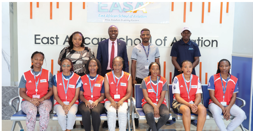
EASA Women's Volleyball Team, flanked by the Office of the Dean of Students.

EASA enriches the learning experience by incorporating co-curricular activities such as volleyball, basketball, swimming and various indoor games. These activities promote teamwork, discipline and student well-being, complementing the School's holistic approach to aviation training.