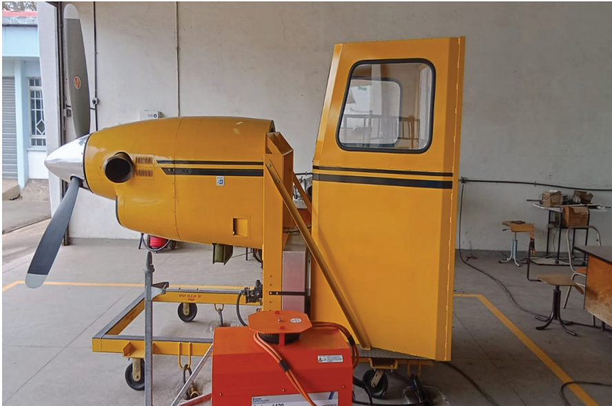
PT6-A runnable turboprop engine used for the practicals during the study of engine performance and associated components