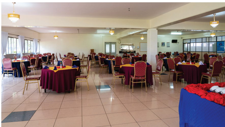
The school Dinning facility