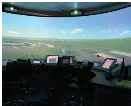
Air Traffic Management Training Simulator