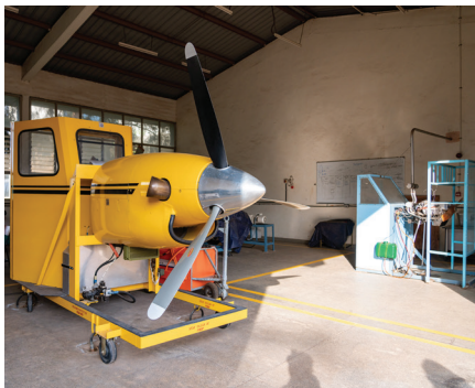
Runnable Turbo-prop engine