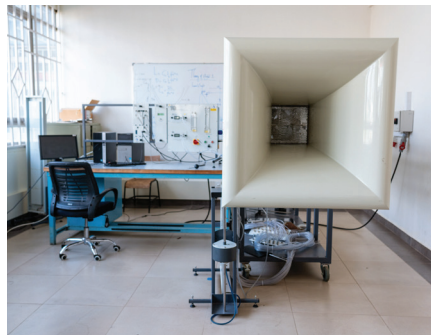
Subsonic Wind Tunnel