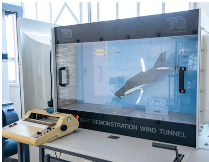
EASA Flight Demonstration Wind Tunnel

EASA continues to invest in modern training equipment to enhance practical learning across its programmes. From specialised laboratory tools to advanced aviation training systems, these resources ensure students gain hands-on experience aligned with current industry standards.