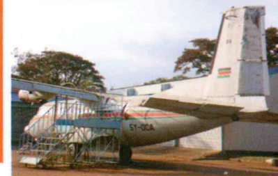
NORD 225 Training Aircraft