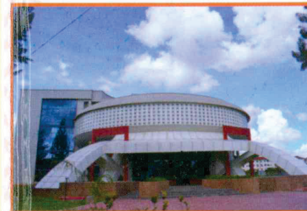
EASA's state-of-the-art library