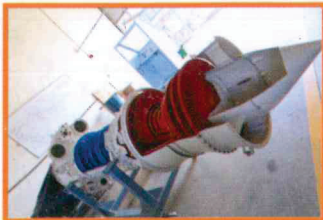
Gas turbine engine