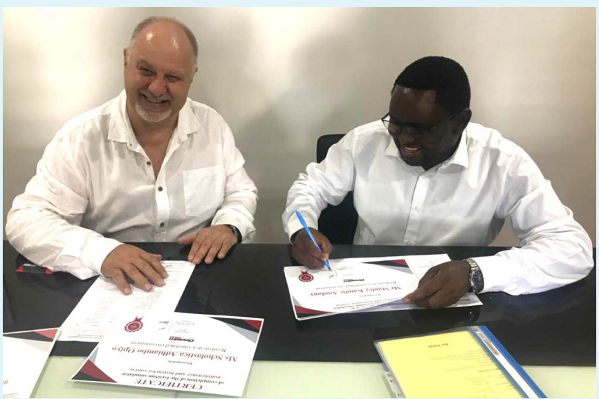
Director EASA (Right), in the process of accepting the Flight Planning Equipment and System for FOO training, at Brisbane Australia.

The custom made Cessna citation mustang synthetic flight trainer that is equipped with GDU (General Display Unit) 1040A, MFD 1500, GMA1347, GMC 710(Auto pilot) GCU 475(FMS keypad), audio panel among other switches, will revolutionize Foo training at EASA. Learners will now have the opportunity to experience the effectiveness of their actions through flight computing and practicing crew briefing.