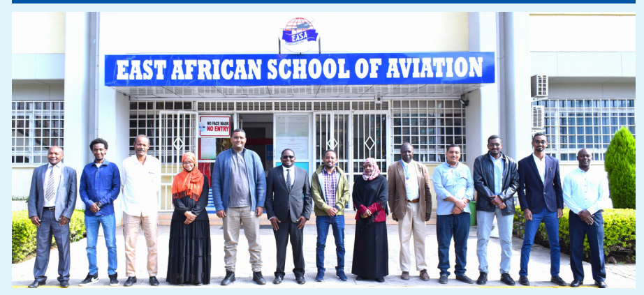
ATSEP Phase 1 Course Closure with participants from Sudan CAA.