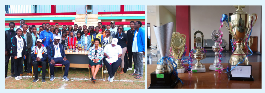
EASA was honored to Host the 3^{rd} Term Ketisa Games in November 2022, and managed to win the displayed trophies. Congratulations to the able participants.